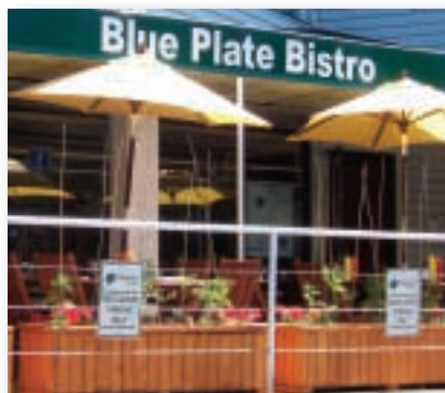
Guests particularly enjoy the patio seating.

“The Blue Plate Bistro is good food done right,” says owners Adam and Elli Roustom. Adam, who is also the chef, further states, “Blue Plate is both our name and our food. It’s scrambled eggs with bacon and it’s pulled pork sandwiches with just the right amount of sauce. We are good food done right for a great price.”